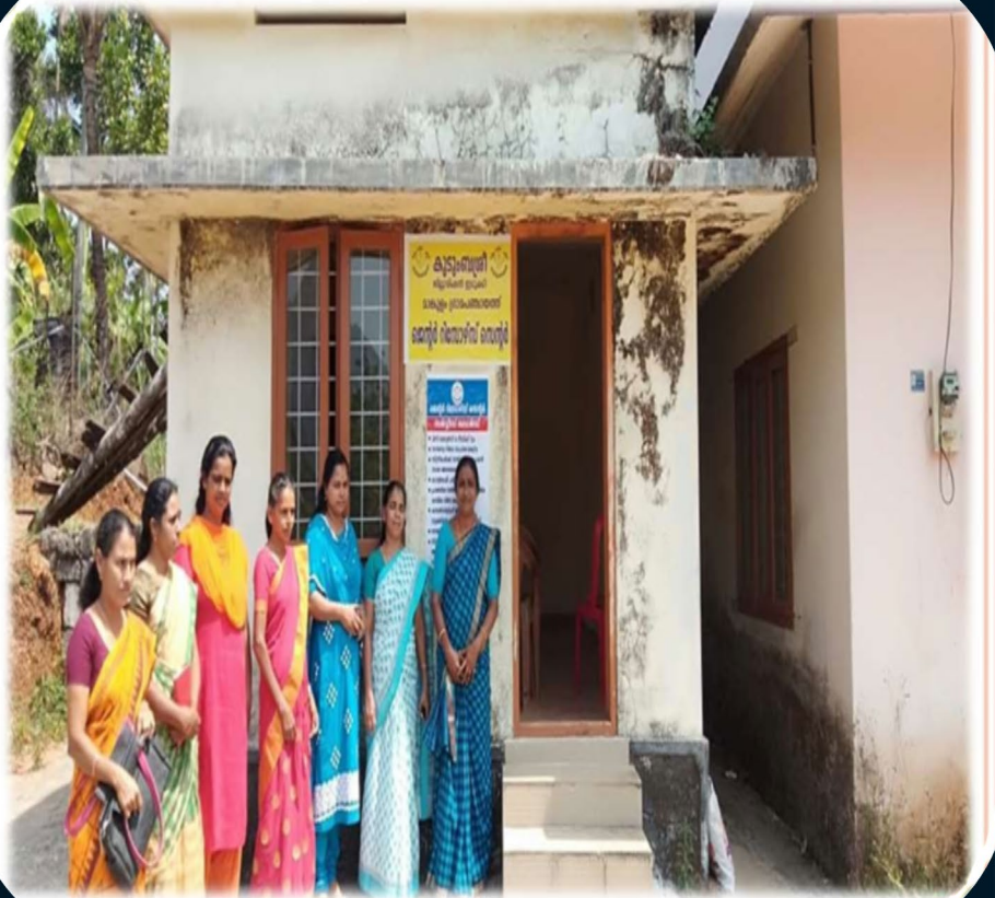
GENDER RESOURCE CENTRE